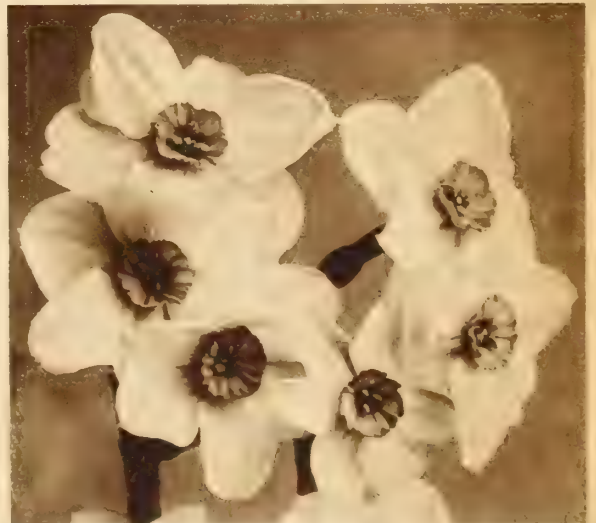
HARDY CLUSTER-FLOWERED DAFFODILS